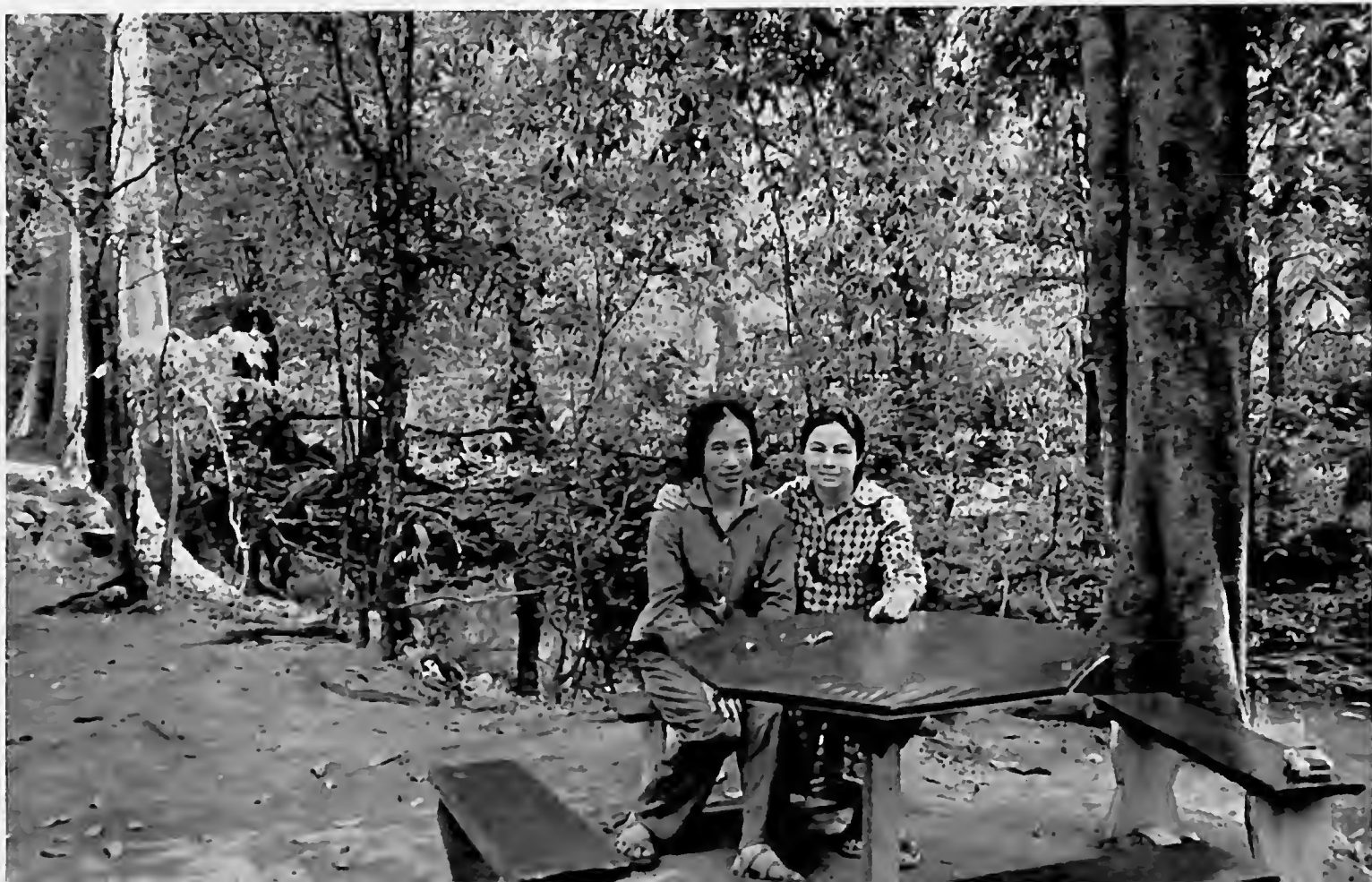
Madame Sihanouk and her guard.